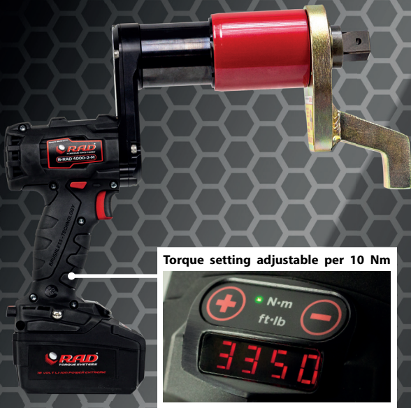
Torque setting adjustable per 10 Nm