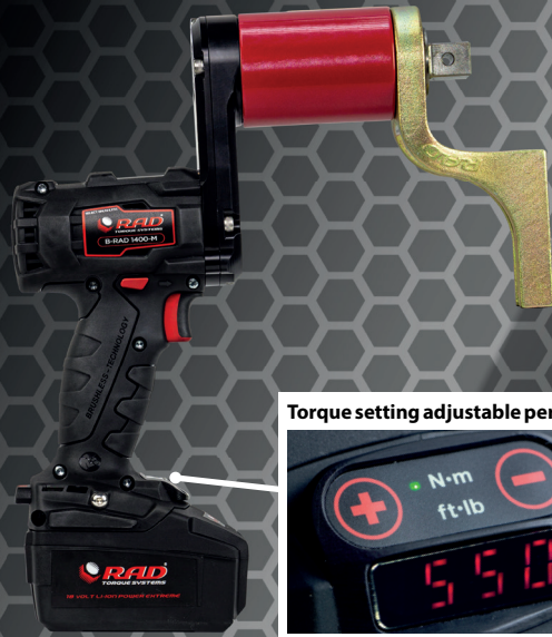
Torque setting adjustable per 10 Nm