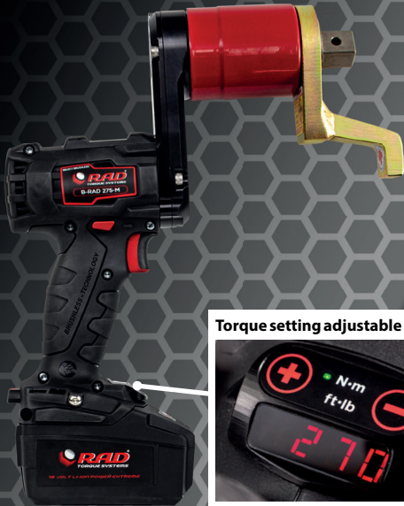
Torque setting adjustable per 10 Nm