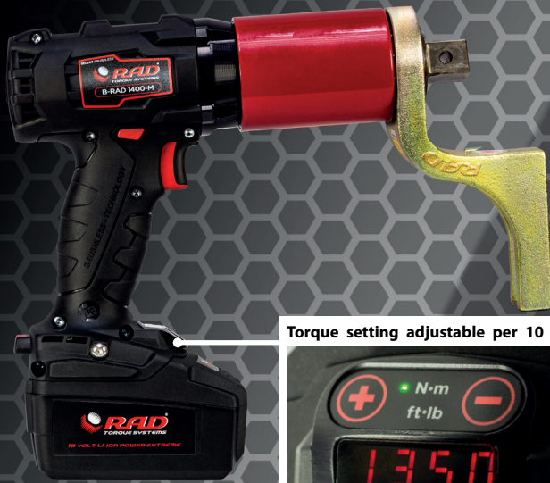
Torque setting adjustable per 10 Nm