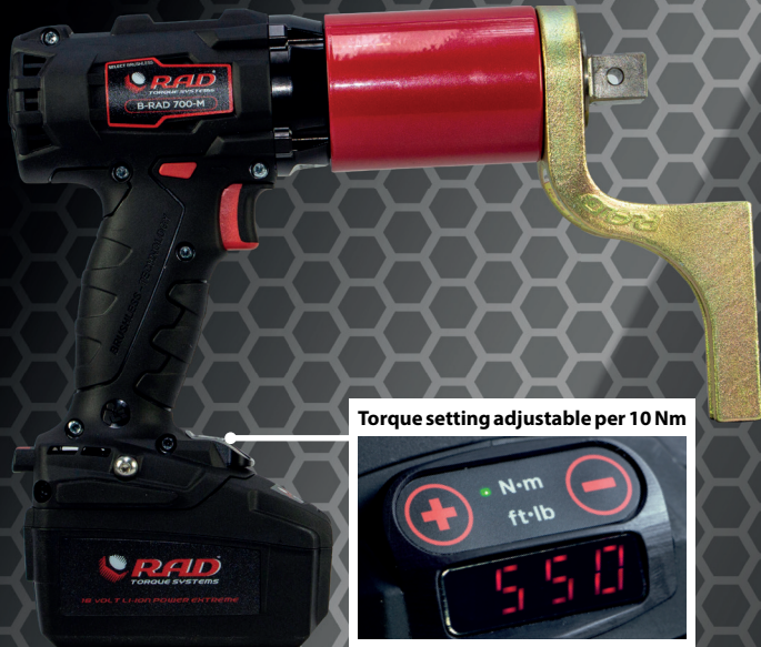
Torque setting adjustable per 10 Nm