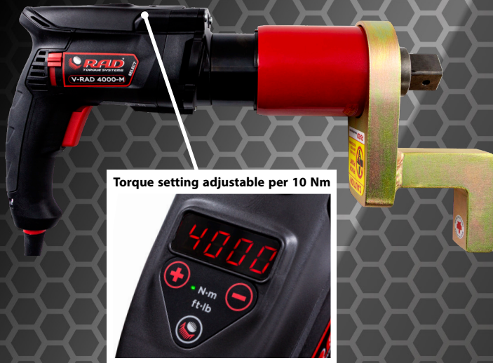
Torque setting adjustable per 10 Nm